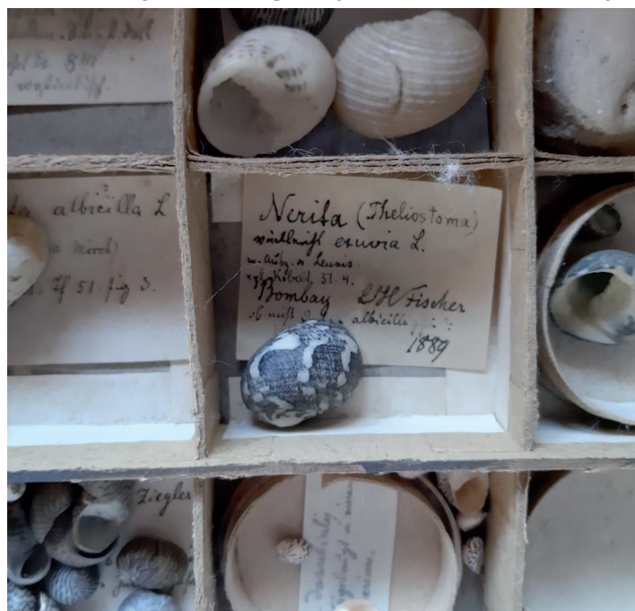
Mollusc shells from Göttweig Abbey

The second natural history collection transferred from the abbey to the NHM was the collection of mollusc and snail shells from various terrestrial, fresh water and marine