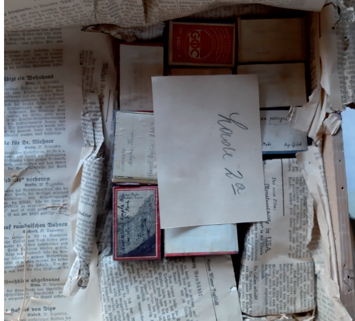
Crate mollusc shells Göttweig Abbey

Directly after the appointment of a temporary administrator in February 1939, the monks were interrogated in the abbey and at the Vienna Gestapo headquarters so as to obtain material for the expropriation. Several of the monks suffered violence during the interrogations. After their release in April 1939, they were forbidden from returning to the abbey and were put under house arrest in a rectory belonging to it. The Gestapo accused the monks of sexual abuse – there had in fact been court cases for sexual abuse, which were already concluded before 1938 – and of mismanagement. Following the approval of the Reich Ministry of the Interior and the Reich Commissar for the Reunifica-